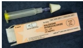
Atomizer nasal spray