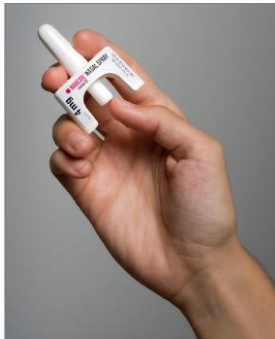
Narcan® pump nasal spray

Three different types of naloxone devices are commonly used ( see below ), and one of these should be part of any opioid recovery safety plan.